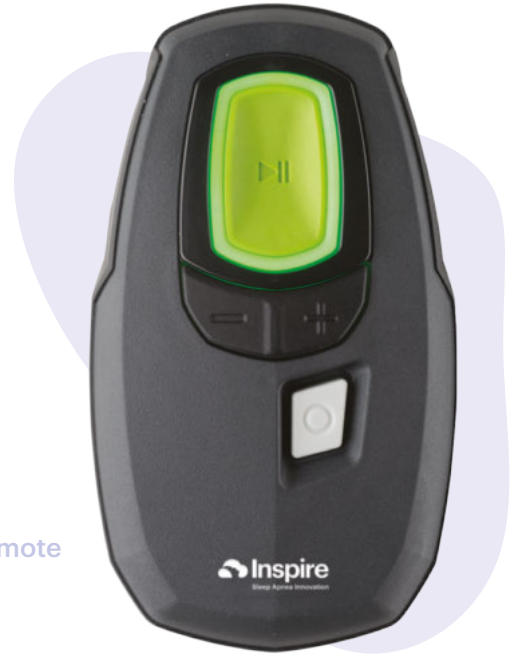
Inspire Sleep Remote

Inspire works inside your body while you sleep. It's a small device placed during a same-day, outpatient procedure. When you're ready for bed, simply click the remote to turn Inspire on. While you sleep, Inspire opens your airway, allowing you to breathe normally and sleep peacefully.